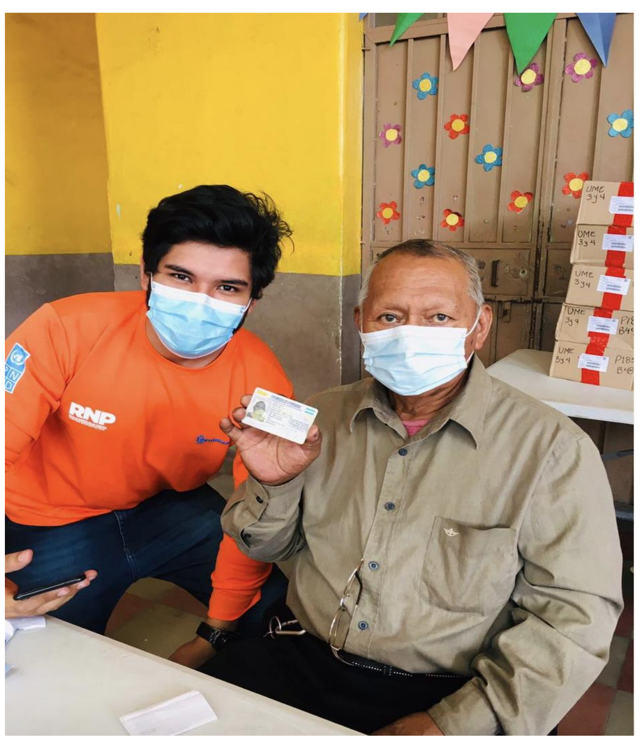
A citizen receiving his new national identification card in Comayagua, Honduras, March 2021