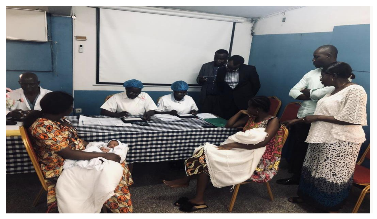
Pilot birth registration linking health sector with civil registration in DR Congo. Nurses and midwives are using tablets equipped with an application and the information is communicated in real time to the Civil Registry