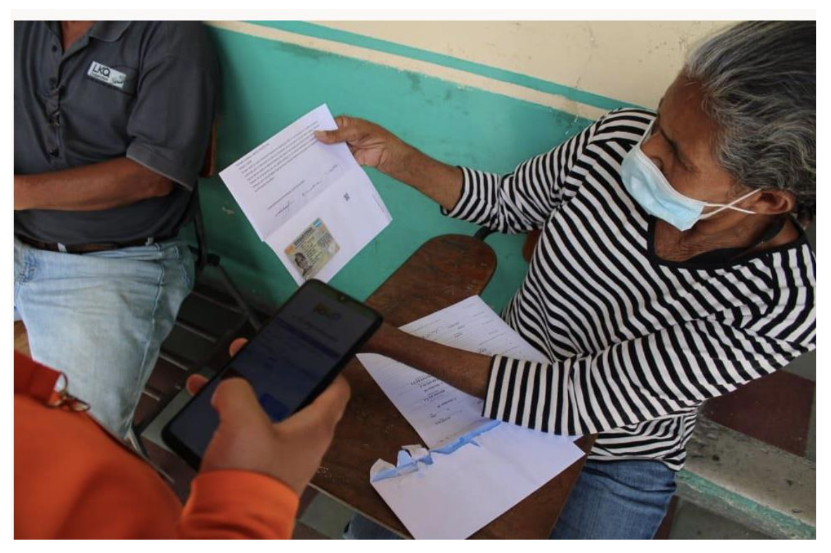
A woman receiving her new national identification card in Danlí, El Paraíso, Honduras, March 2021