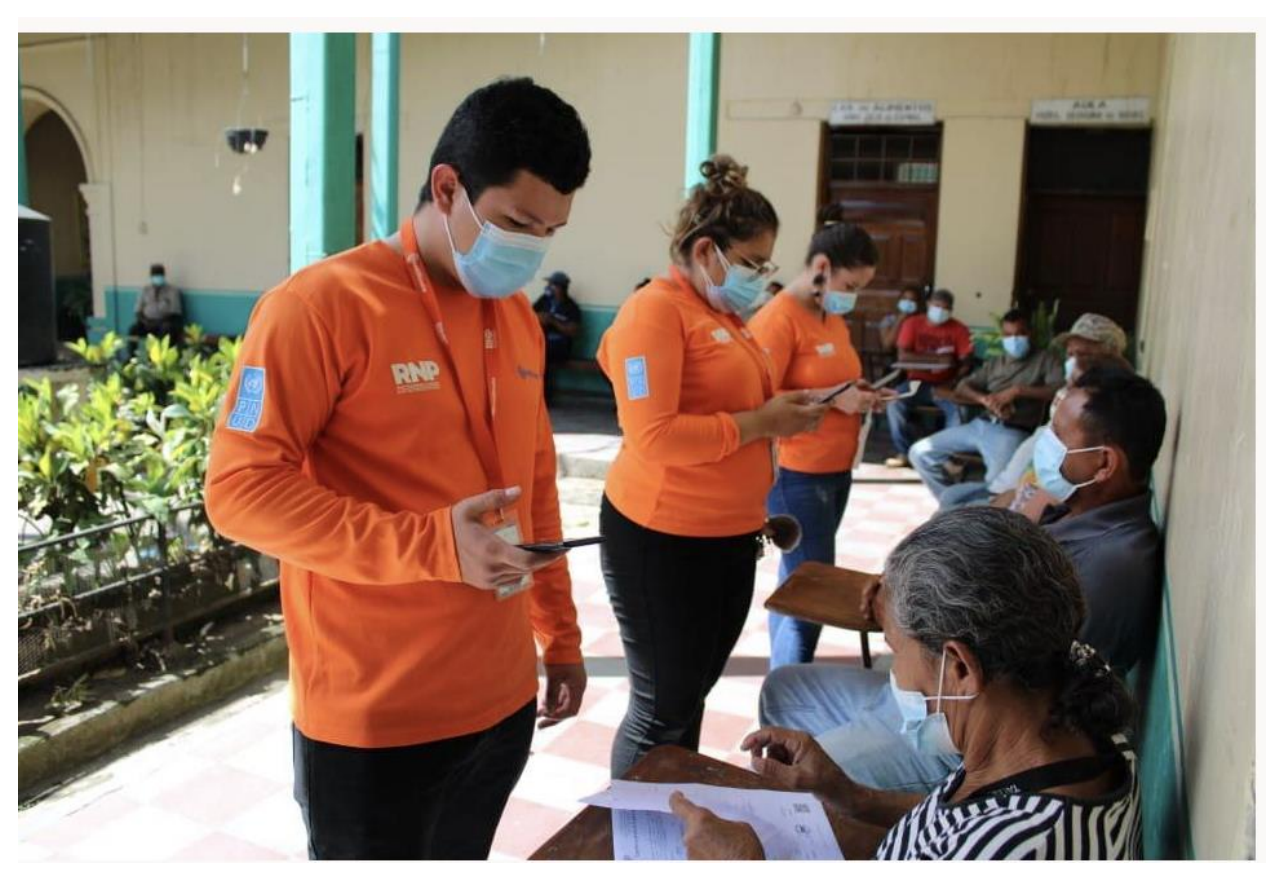
Registrars checking online citizen ID status before delivery in Danlí, El Paraiso, Honduras, March 2021