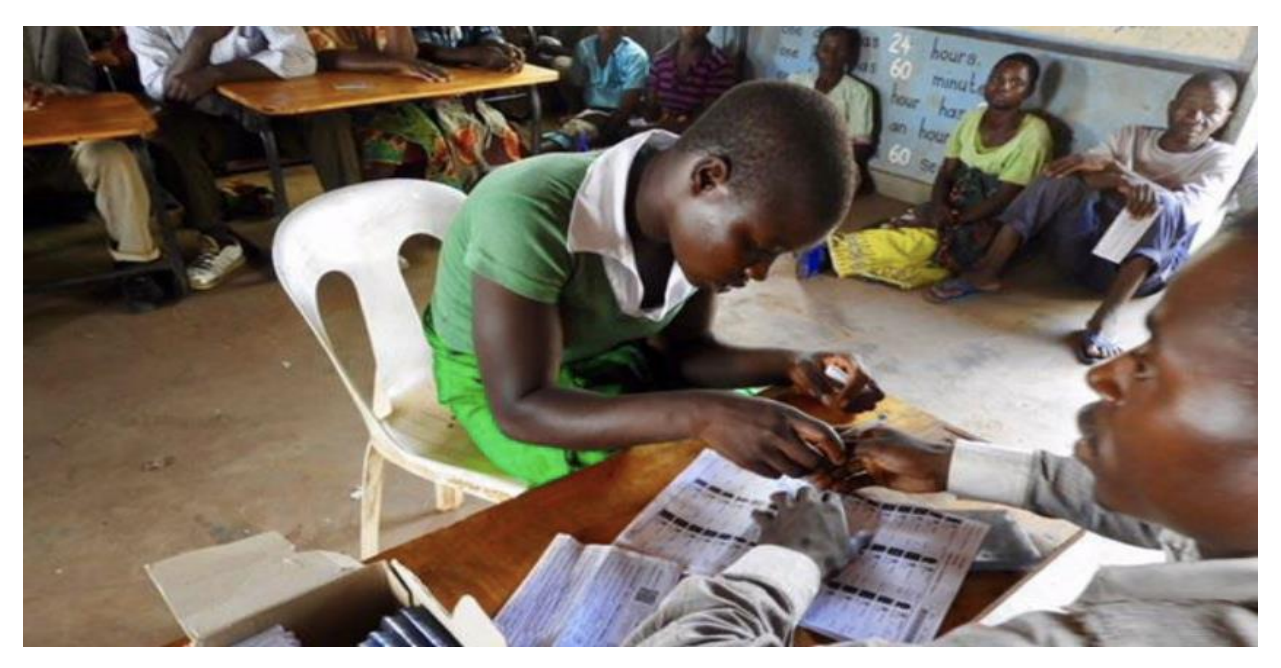
A National Registration Bureau (NRB) officer assisting a citizen to collect her national ID card while others patiently wait their turn in Malawi