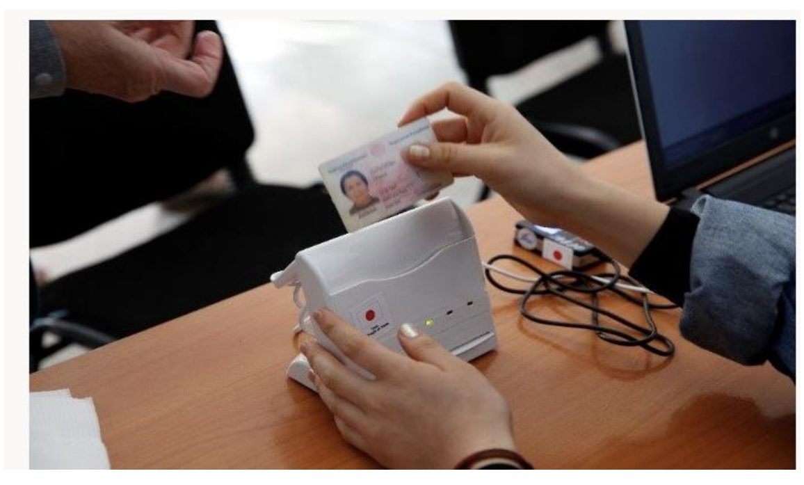
Plastic identity card inserted into a combination-reader in Kyrgyzstan