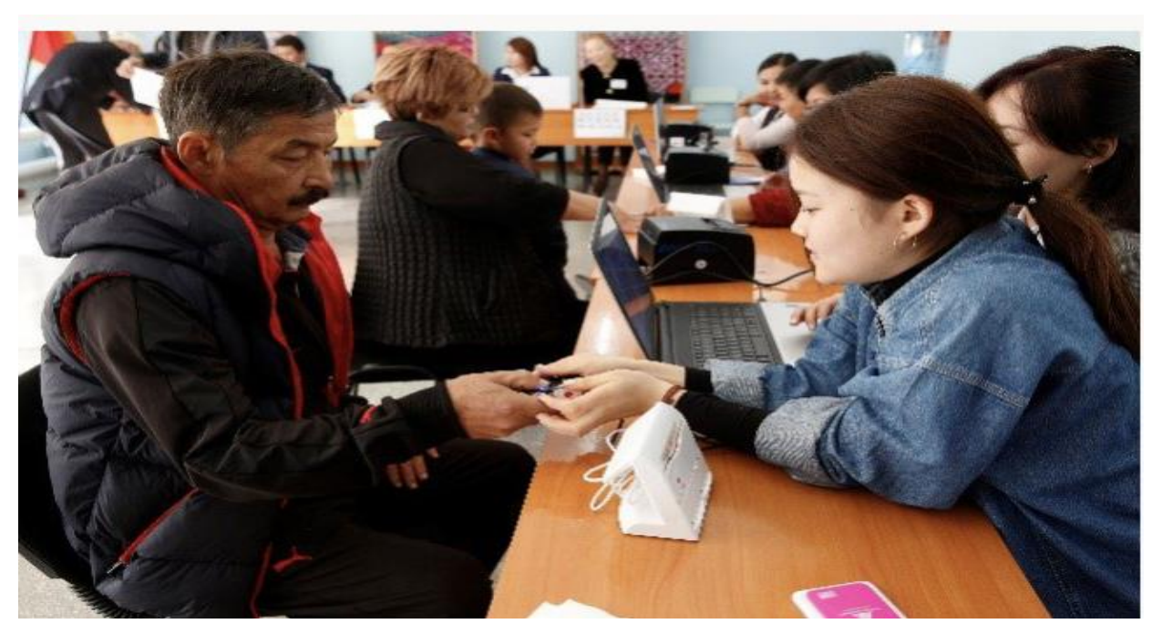
A voter having his fingerprint and electronic ID read by a combination-reader in Kyrgyzstan