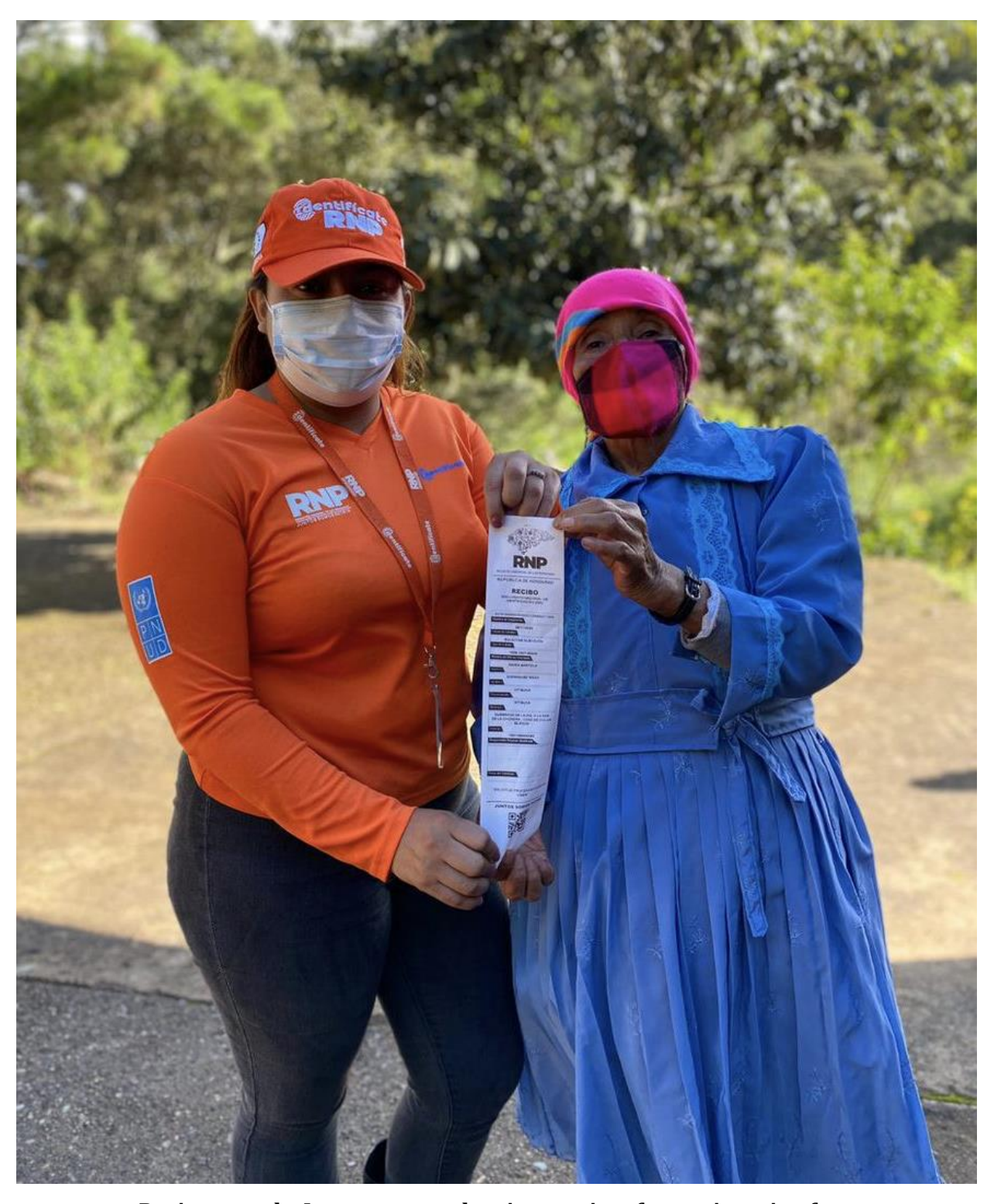
Registrar and a Lenca woman showing receipt after registration from a new ID in Esperanza, Intibucá, Honduras, Sept 2020